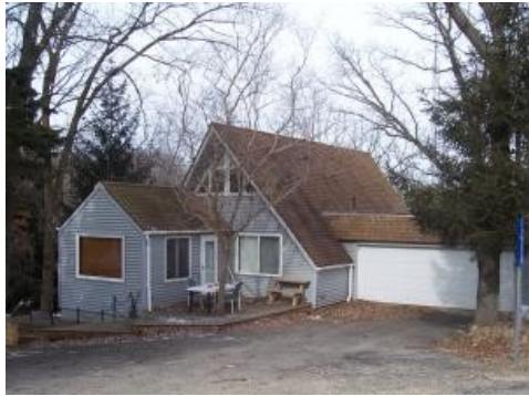
12A228 Jefferson Ct. Apple River, IL 61001 $390,000.00

3505 N.E. Apple Canyon Road Apple River, IL 61001 Phone (815) 492-2231 Fax (815) 492-1484