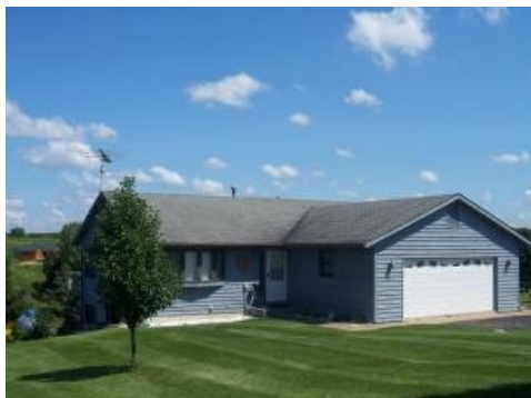
14A98 Marina View Drive Apple River, IL 61001 $249,000.00

3505 N.E. Apple Canyon Road Apple River, IL 61001 Phone (815) 492-2231 Fax (815) 492-1484