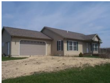
8A172 Liberty Bell Ct. Apple River, IL 61001 $259,000.00